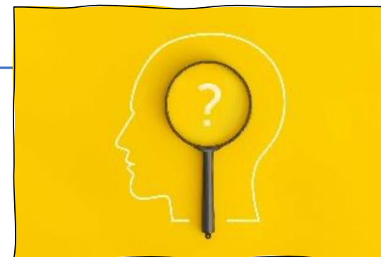
Poll on languages