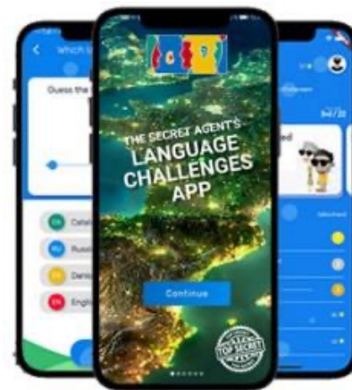
"Self-evaluate your language skills"