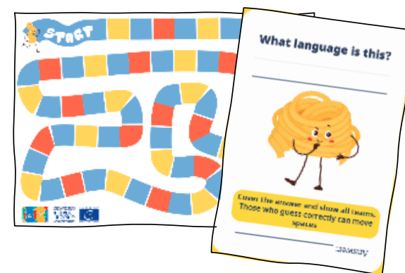
Language board game "Linguine"